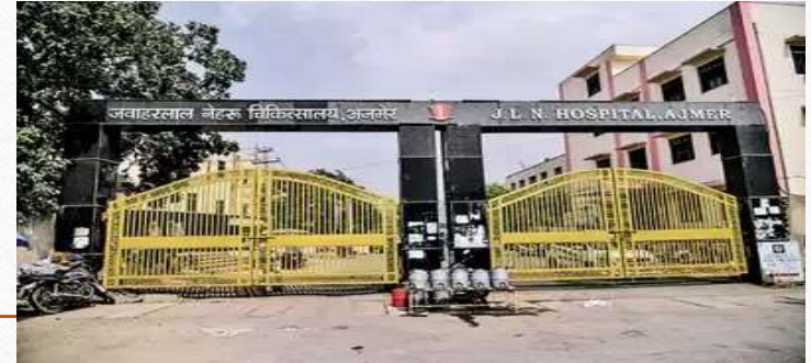
Construction of Medicine Block at JLN Hospital, Ajmer, Rajasthan.