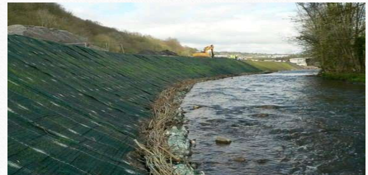
River Bank protection/erosion control measures on the left bank pf river Subansiri adjacent to village Gerki - 2 (RD 29 KM to - 30 KM)