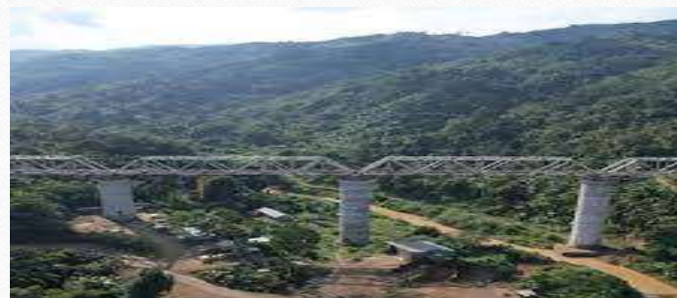
Construction of foundation and sub structure over pile foundation for Tall Bridge of new BG Railway line from Bairabi to Sairang (Mizoram).