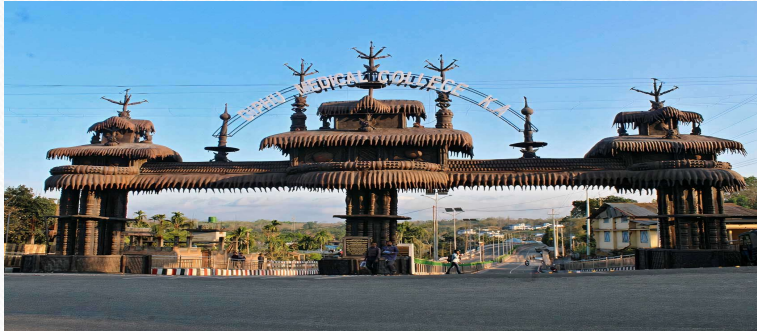
Construction Of Assam Hills Medical College & Research Institute, Diphu, Karbi Anglong.