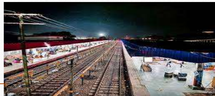
NBQ-GLPT-KYQ Doubling Project (Assam).