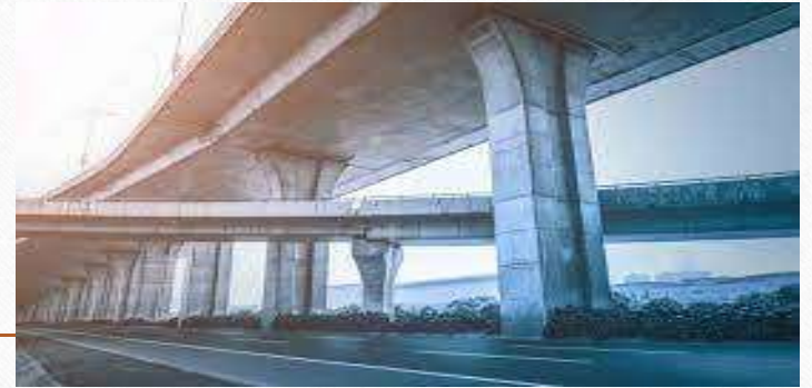
Maintenance of 3 lane Brahmaputra Bridge including their expansion joints & bearing, providing all necessary signboard, road furniture etc..