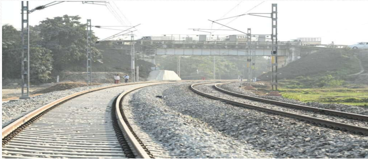
Construction of sub-structure and super-structure on pile foundation of major bridges in connection with double line work of New Bongagaon-Agthori doubling project.