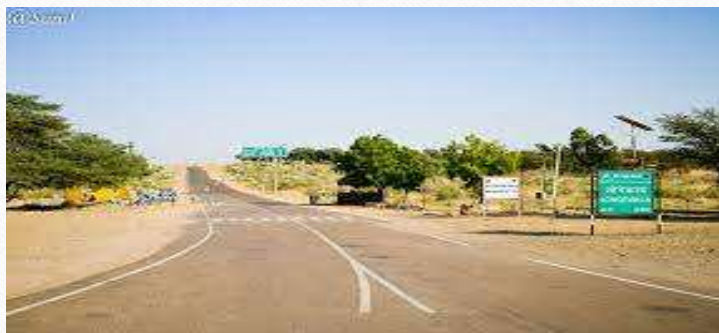
Operation & Maintenance Of Descoped Length Of 2 Lane With Paved Shoulder Tanot-Jaisalmer To Jaisalmer Bypass. In The State Of Rajasthan.