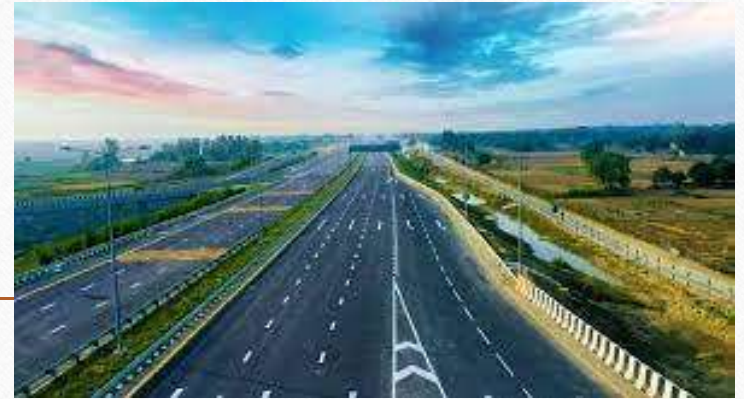
Maintenance of National Highways from Tihu to Puthimari section of NH-31 in the State of Assam.