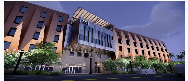
Detailed Design and Construction of ASU Campus and Facilities.