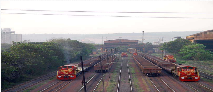
Boddavara- Sivalingapuram Stations of Kottavalasa-Koraput Doubling of Waltair Division in East Coast Railway