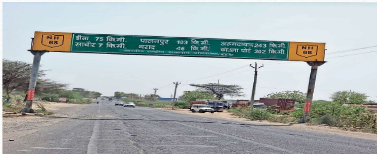
Short Term Improvement & Routine Maintenance of Two- Lane of NH-68 in the State of Rajasthan.