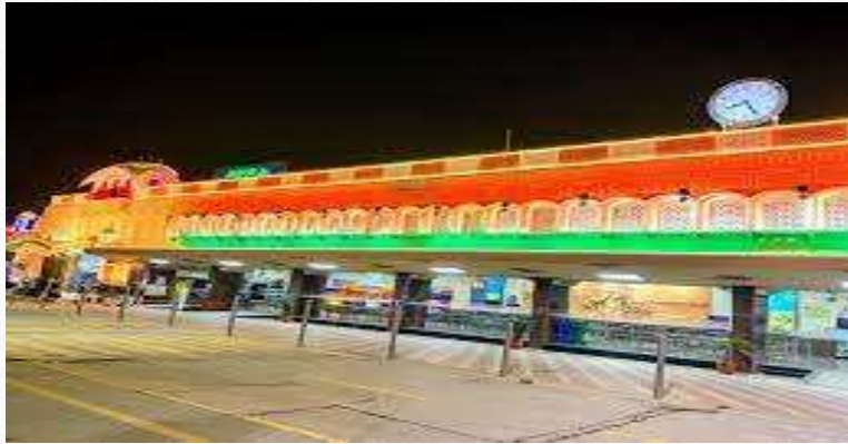
Major upgradation of Gandhinagar (Jaipur) Railway Station of Jaipur Division of North Western Railway through EPC.