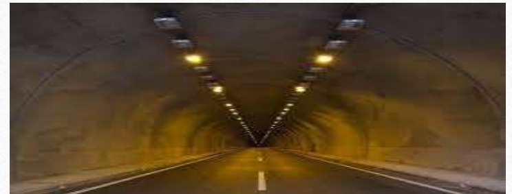
Construction of single line BG cut & cover tunnels from in between stations Kawnpui to Sairang including counterfort retaining wall on pile foundation & protection work along with all other ancillary works.