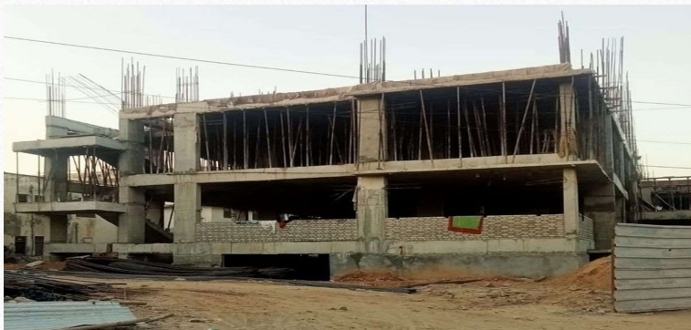
Construction of Pediatrics Block and multi level parking.