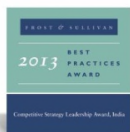
FROST & SULLIVAN Best Practices-2013