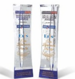
Business today/YES bank Excellence Awards-2013