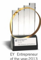
EY Entrepreneur of the year-2013