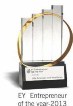
EY Entrepreneur of the year-2013