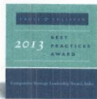
FROST & SULLIVAN Best Practices-2013