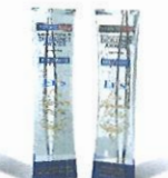
Business today/YES bank Excellence Awards-2013