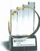
EY Entrepreneur of the year-2013