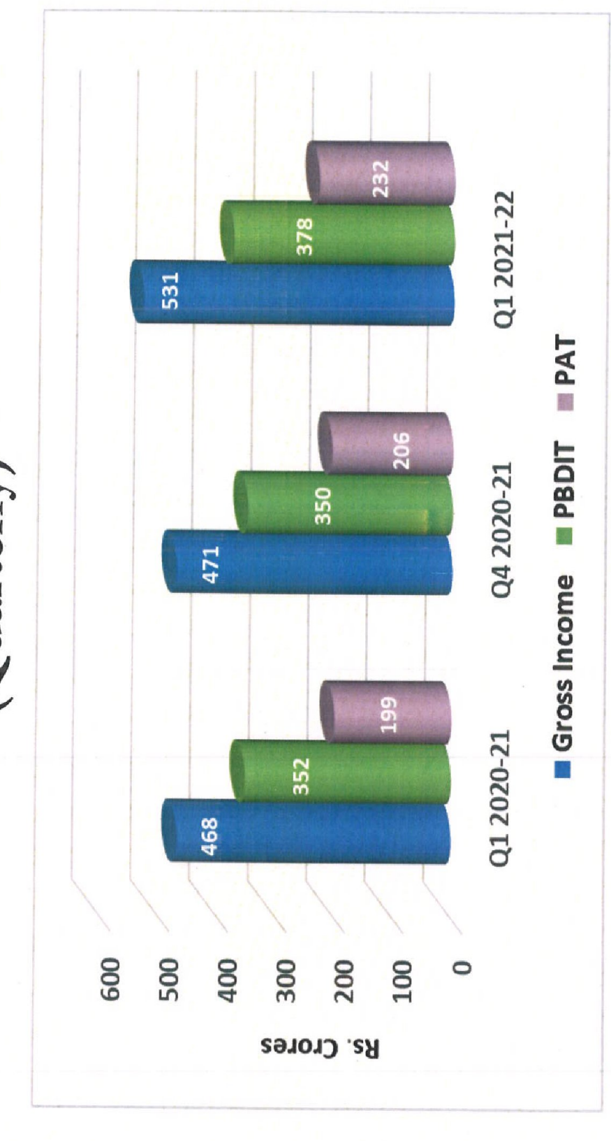
STANDALONE FINANCIALS (Quarterly)